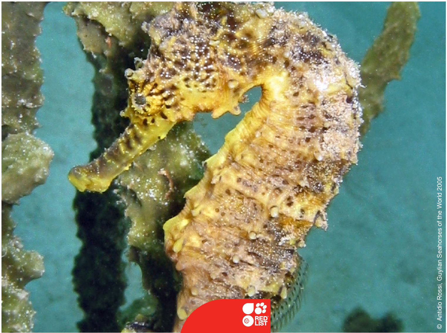
© Antidio Rossi, Guylian Seahorses of the World 2005